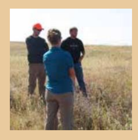
Adaptation to Climate Change

Delivering science-based, culturally relevant production, marketing and financial management information to help Indian producers becoming economically successful and help build Native Nation food security.