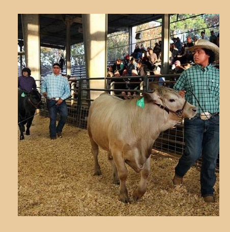
Farmer & Rancher

FRTEP installs agriculture programs that empower reservations and surrounding communities to grow food, restore tribal traditions and culture while building community.