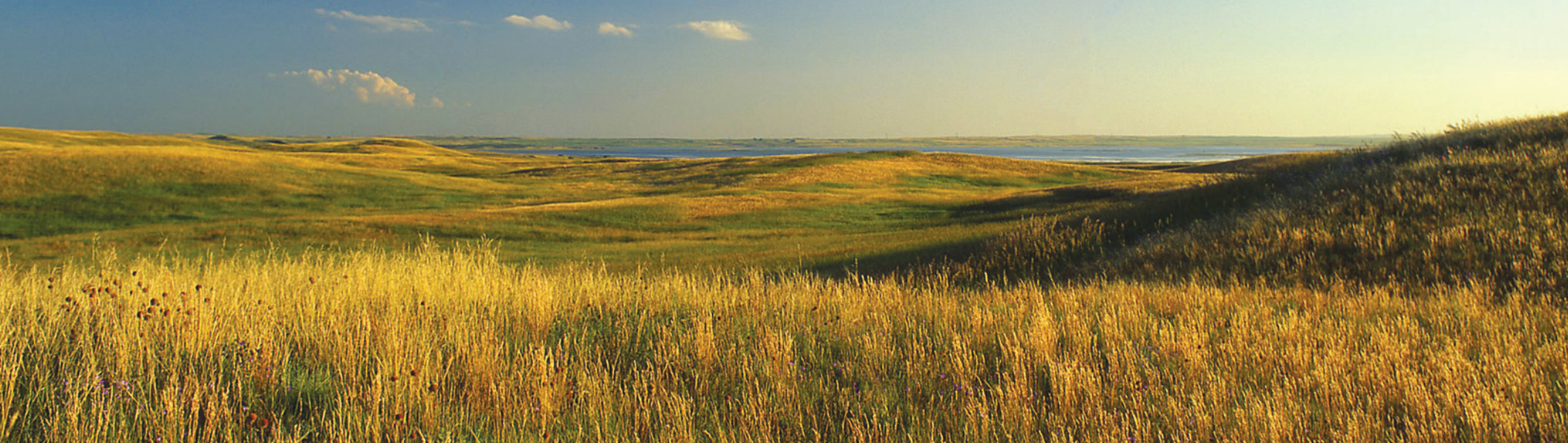
Native prairie at North Dakota's Chase Lake National Wildlife Refuge.