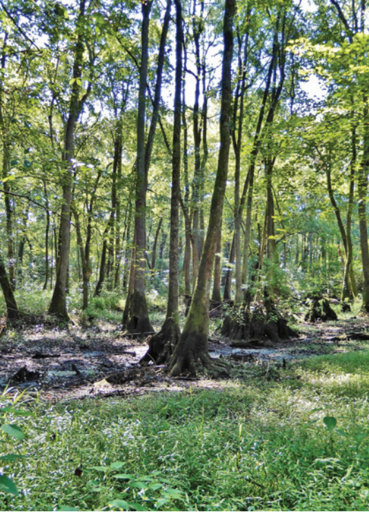
Bottomland hardwoods in North Carolina's Lumber River State Park.