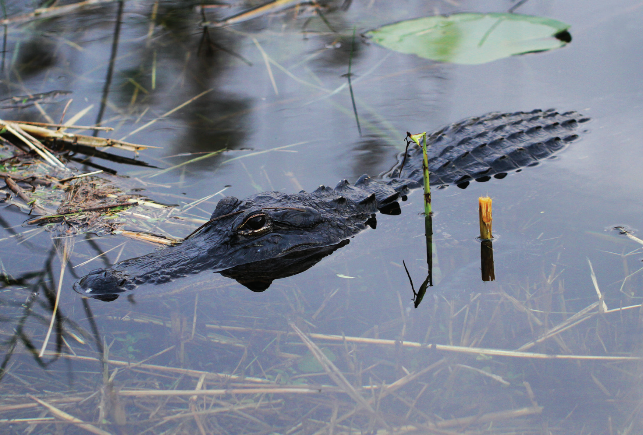
An American alligator in Everglades National Park.