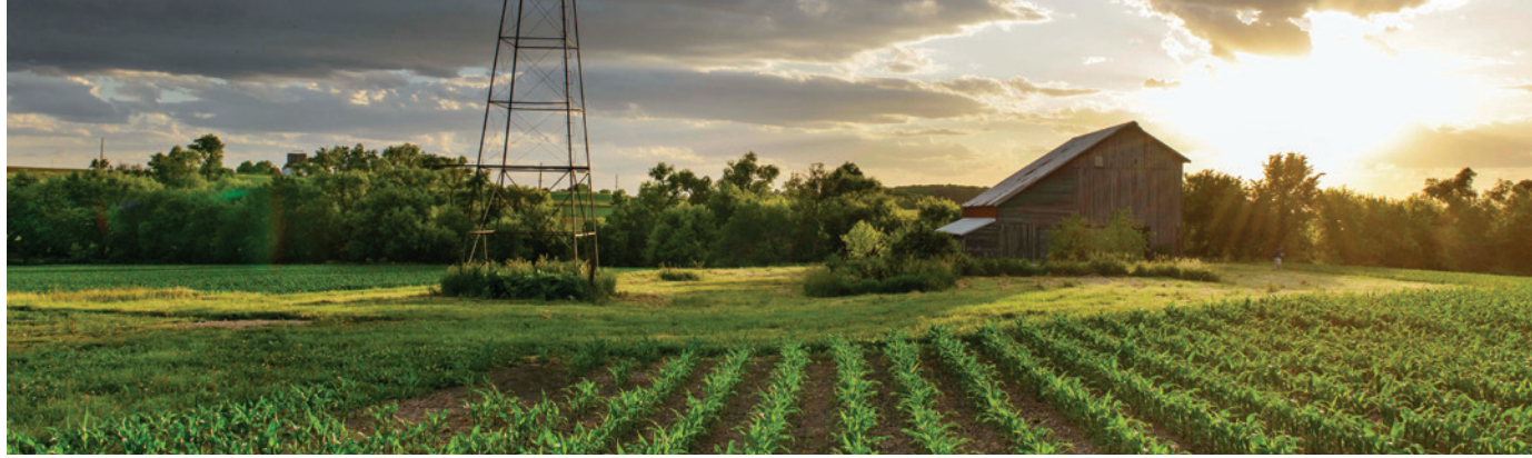
A farm in Linn County, Iowa. America's farmers and ranchers are well equipped to play a role in successful climate mitigation and adaptation.