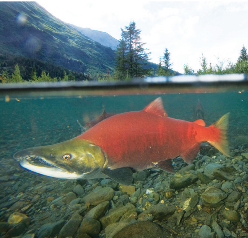
Alaskan salmon, including the sockeye pictured here, are one of many species in the U.S. at risk from climate change. Natural climate solutions can benefit wildlife populations while mitigating climate change. Credit: USFS Alaska Region.

A range of nature-based strategies can be deployed in our forests, watersheds, coastal areas, grasslands, farmlands, and other natural systems to enhance the health of our soils and ecosystems. In turn, these approaches can expand the national carbon sink, improve the quality of wildlife habitat, reduce climate risks to communities, and create economic opportunity through reclamation, restoration, and maintenance of these sinks, or the implementation of new management practices.