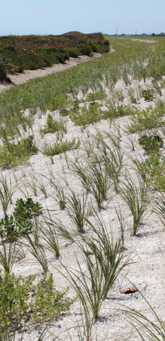
Native vegetation planted on restored sand dunes in Florida. Natural infrastructure such as dunes can enhance the resilience of human communities to climate change.