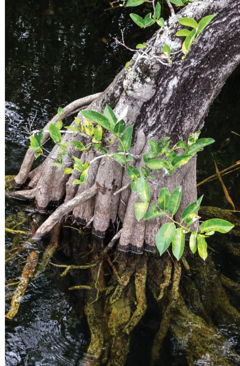
Mangroves in Everglades National Park. Protection of existing coastal ecosystems, including mangroves, offers opportunities for carbon mitigation and climate adaptation. Credit: dconvertini, via Flickr.

• Significantly increase federal investments in America's water infrastructure, prioritizing natural solutions and climate-resilient infrastructure. Our water and wastewater facilities have exceeded their intended lifespans and are breaking down, with the most severe impacts often disproportionately borne by low-income communities and communities of color. The threat of climate change is further stressing these water systems as they increasingly struggle to keep up with flooding, sea level rise, droughts, and other impacts. To help address our infrastructure backlog and adapt our water and wastewater utilities to a changing climate, Congress should increase federal investments in water infrastructure, including roughly tripling appropriations to the Clean Water State Revolving Fund (from $1.7 billion in FY18 to $6 billion annually) and the Drinking Water State Revolving Fund (from $1.95 billion in 2020 to $6 billion). This funding should require and incentivize the use of natural and green infrastructure and invest in making our water systems more climate resilient. 34