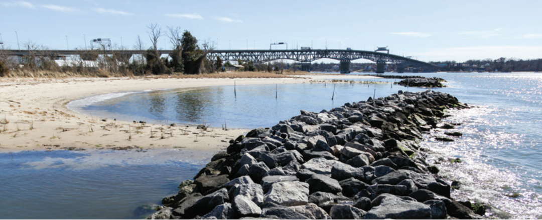
Riprap lining a living shoreline in Gloucester County, Virginia.

Oceans and coastal ecosystems play a valuable role in mitigating climate change, particularly through the ability of wetlands, mangroves, and seagrasses to capture and store carbon. In fact, these repositories of “blue carbon” sequester more carbon per unit area than forests with longer average duration.