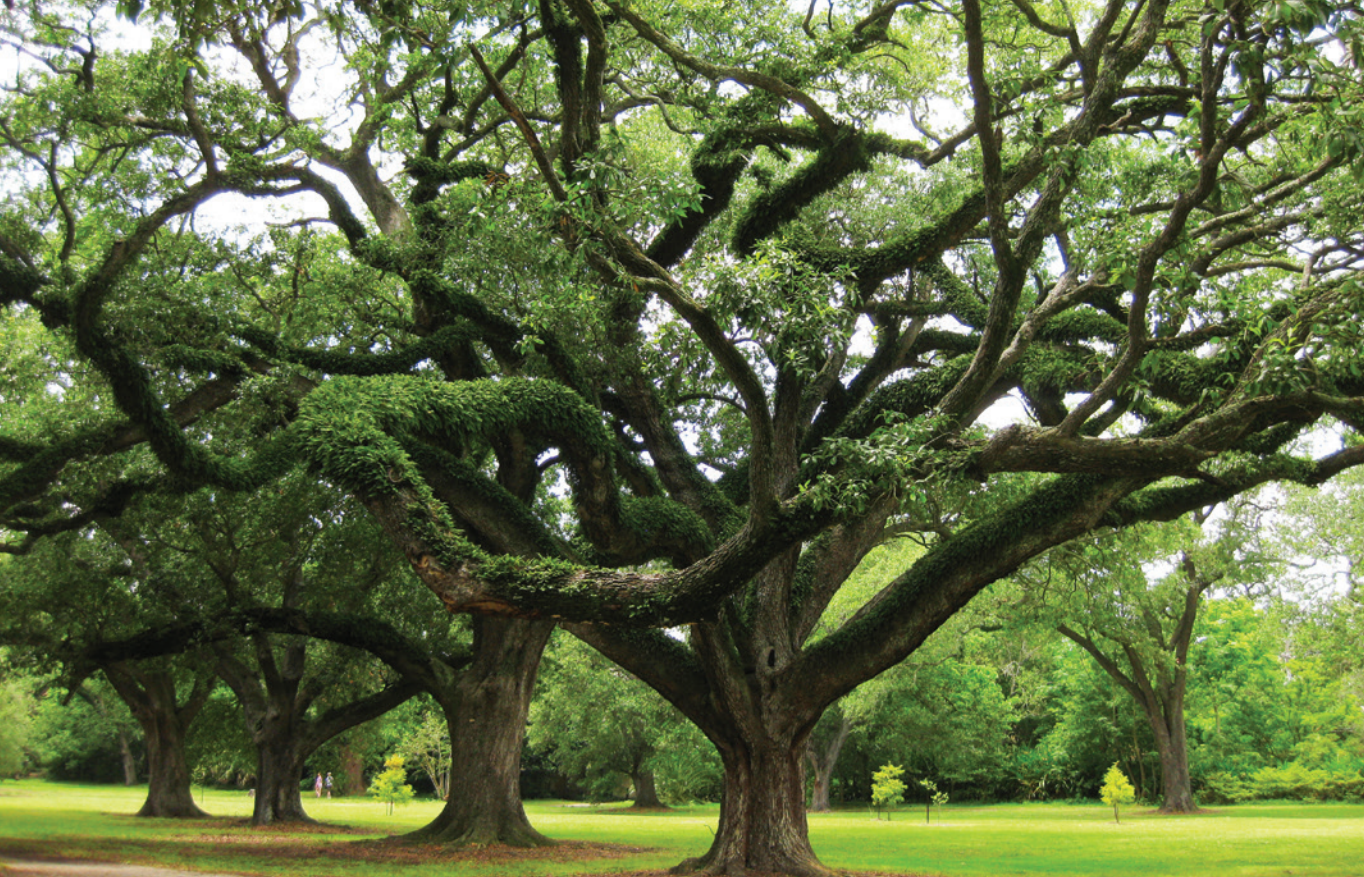
Southern live oaks in Audubon Park, a 35-acre city park in New Orleans.

important ecosystem services (e.g., riparian buffers, windbreaks, and pollinator habitat). 16 This practice is not generally appropriate on naturally treeless landscapes, as it can fragment remaining habitat and reduce populations of declining grassland bird species.