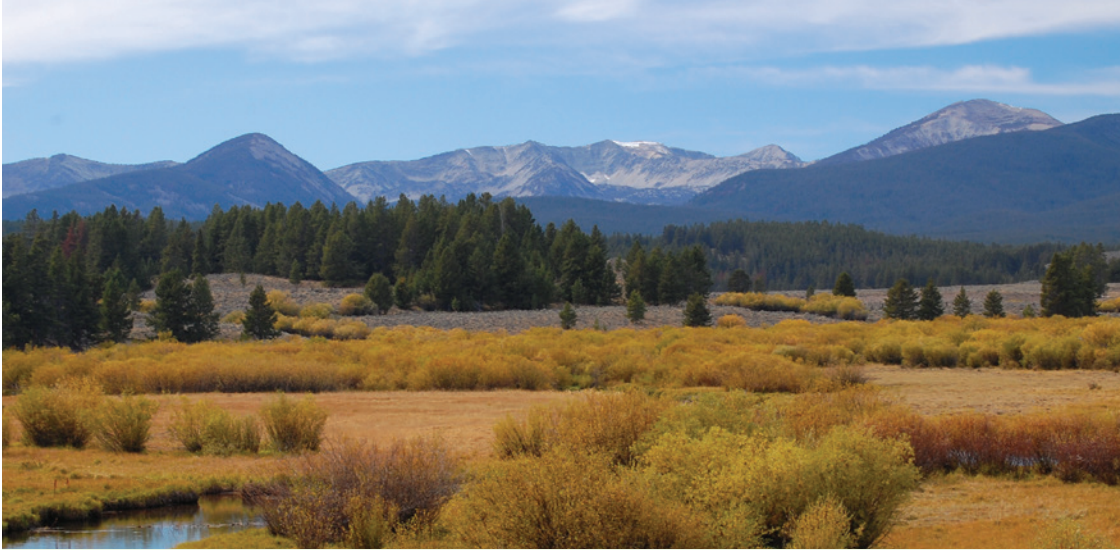
Fall in Montana's Beaverhead-Deerlodge National Forest.

A midst the global effort to confront the growing risks of climate change, natural climate solutions have risen to the forefront of policy discourse as being critical to success. The National Wildlife Federation defines the concept of natural climate solutions as strategies that support or enhance the ability of natural systems to both mitigate climate change (enhancing the removal or storage of carbon) and strategies that increase the resilience of human communities and wildlife populations to the impacts of climate-related natural hazards. These two focal areas are subsets of our broader efforts to support climate solutions through policies and programs that reduce anthropogenic greenhouse gas (GHG) emissions and enhance climate adaptation for natural and human systems.