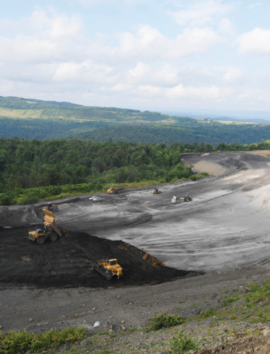
The Ehrenfeld Abandoned Mine Reclamation Project in Pennsylvania.