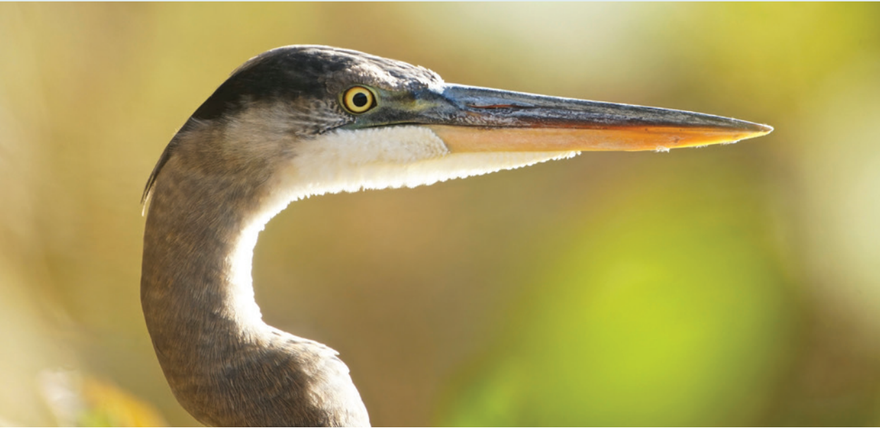
A great blue heron.