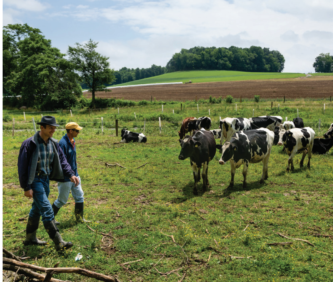
Esh Farm in Lancaster County, Pennsylvania. The farm has implemented best management practices to support trout habitat, as well as stream fencing, livestock crossings, and a riparian forest buffer.

• Provide transition assistance, but not indefinite funding, for adoption of practices that can provide net benefits to farmers and ranchers in the short-to-medium term. Some GHG-beneficial practices, such as cover cropping, rotational grazing and no-till planting can yield net