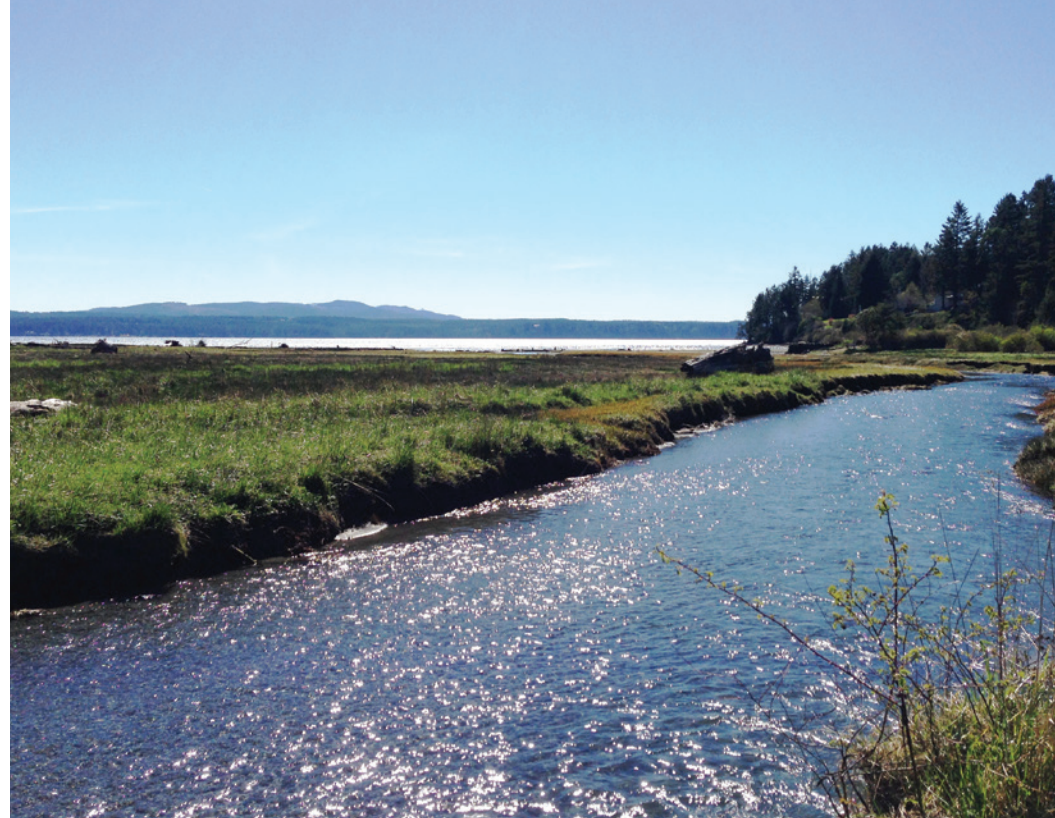
The Dosewallips River floodplain in Washington, site of a project to create and maintain wetland habitats.

• Increase investments in pre-disaster mitigation programs. Historically, the vast majority of mitigation dollars have flowed to communities after disaster strikes, often through Federal Emergency Management Agency