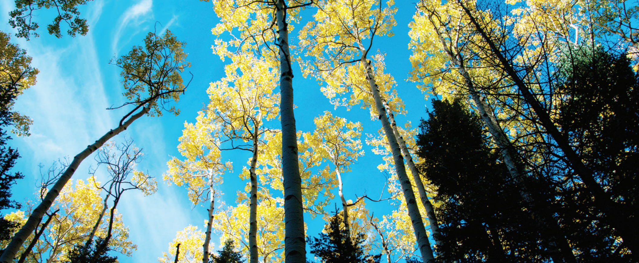
Aspen trees along the Abineau Trail in Arizona's Coconino National Forest.

• Consider mutually beneficial harvest and carbon sequestration opportunities. Supporting markets for sustainably sourced, long-lived wood products can help incentivize keeping forest land forested. Forest management practices should also focus on enhancing harvest and processing efficiency. 14