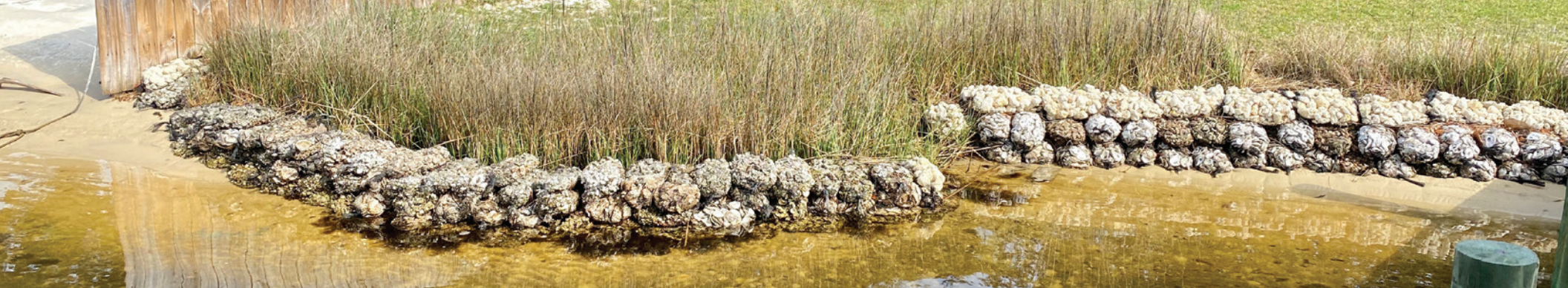
Oyster reef breakwaters and native marsh grasses line a living shoreline in Destin, Florida.

Protecting and restoring natural infrastructure, such as wetlands, dunes, and riparian corridors, can enhance resilience of human communities to climate-fueled disasters and provide critical co-benefits to society.