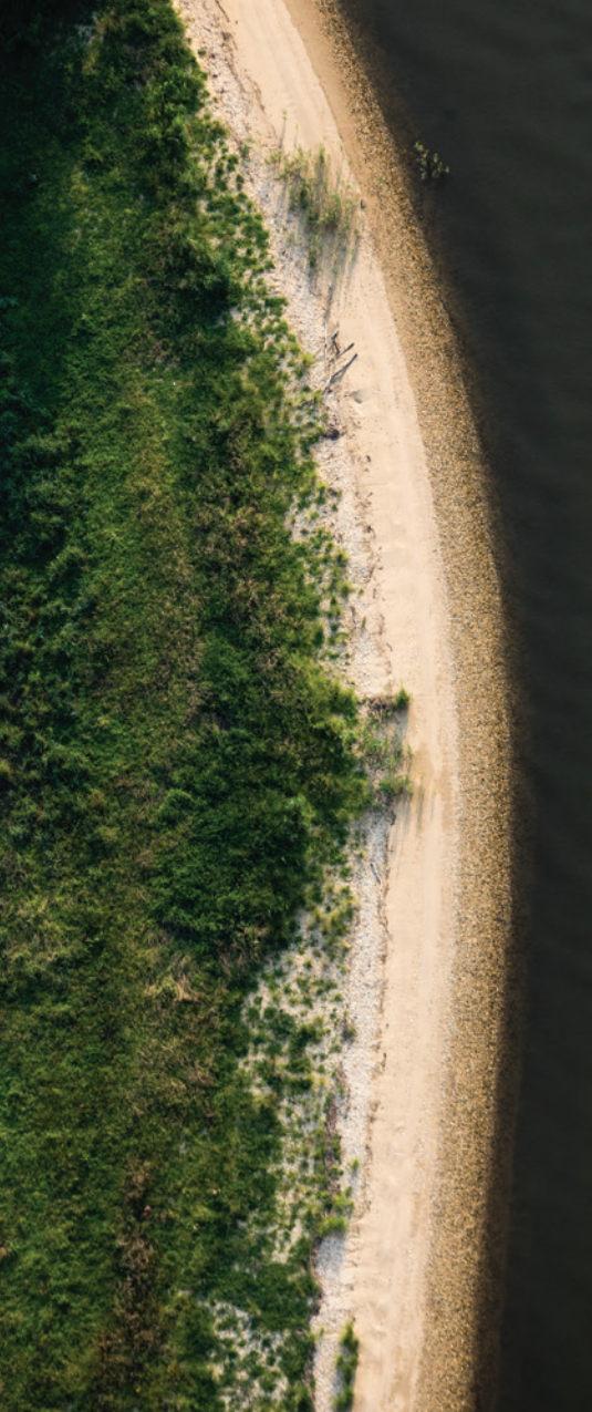
A living shoreline built to withstand sea level rise at Conquest Preserve, on the Corsica River in Maryland.