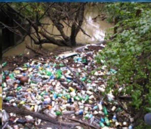
Above: Chattanooga Creek