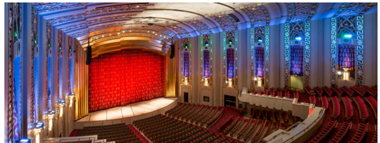
The Bushnell Center for the Performing Arts in Hartford, Conn., is one of the nonprofits that EESI spotlighted for their energy efficiency improvements.

The Bipartisan Infrastructure Law established a first-of-its-kind grant program to help nonprofits improve the energy efficiency of their facilities. Nonprofits play special roles in their communities, and energy efficiency can help reduce operating costs and improve employee, volunteer, and nonprofit client health and wellness.