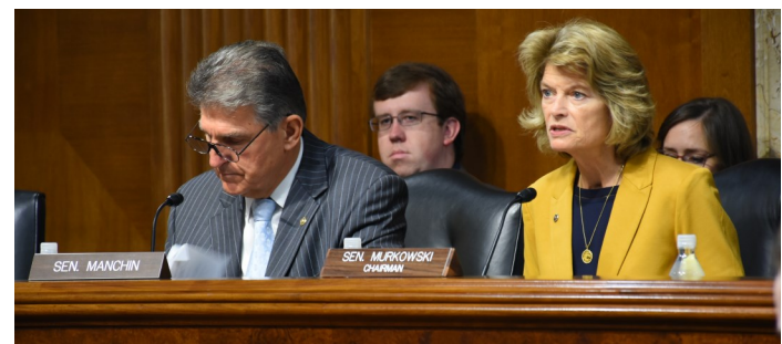
Senators Lisa Murkowski and Joe Manchin at the hearing.

Senator King (I-Maine) expressed interest in on-bill financing, an area where EESI has significant experience. Senator King saw it as an effective measure to motivate people to upgrade the energy efficiency of their homes. On-bill financing allows payments for upgrades to be paid back right on an energy bill. Since energy efficiency upgrades help push these bills lower, households can often save money from the get-go, even after loan repayments. Dan emphasized that people focus on their monthly costs when considering whether they can afford an energy upgrade, such as improved insulation or an upgraded heat pump. Keeping those monthly costs low makes energy retrofits much more accessible!