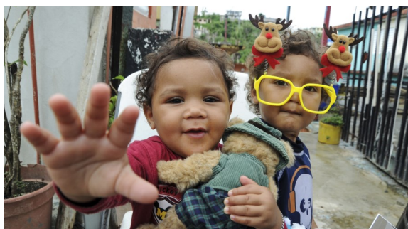
Puerto Rican children at a toy drive for Hurricane Maria victims

A key part of the solution, EESI has long argued, is greater resilience. Emphasizing preparatory measures and preemptive investment in infrastructure can save lives, both during disasters and after them. With your generous support, EESI is holding a briefing series on Building Resilient and Secure Infrastructure. We showcase best practices from states and communities across the country to inform policymakers and stakeholders about what's working (and what's not). EESI's panels, factsheets, and coalition work all help us move toward the goal of long-term energy reliability and resilience. This will help ensure economic development, public health and safety, national security, fiscal responsibility, enhanced equity, jobs, and quality of life.