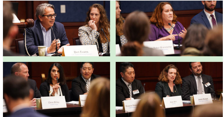
EESI’s new Progress Report briefing series kicked off September 28 with a look at a dozen IRA tax incentives for individuals, businesses, and nonprofits.